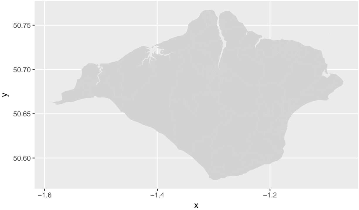
NA (Y01856): ALL_PATIENTS

LSOA_CODE MALE_PATIENTS FEMALE_PATIENTS ALL_PATIENTS